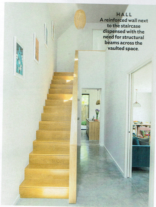
HALL A reinforced wall next to the staircase dispensed with the need for structural beams across the vaulted space.