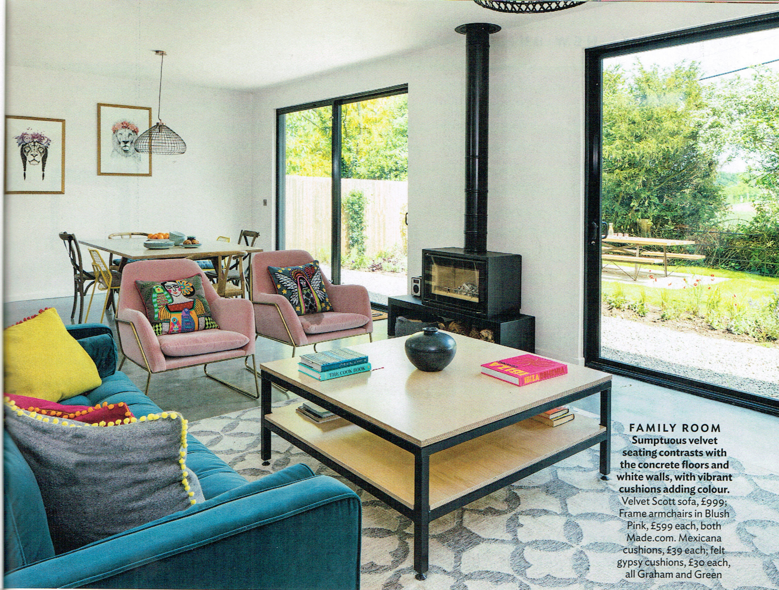
FAMILY ROOM Sumptuous velvet seating contrasts with the concrete floors and white walls, with vibrant cushions adding colour. Velvet Scott sofa, £999; Frame armchairs in Blush Pink, £599 each, both Made.com. Mexicana cushions, £39 each; felt gypsy cushions, £30 each, all Graham and Green