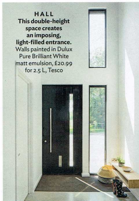
HALL This double-height space creates an imposing, light-filled entrance. Walls painted in Dulux Pure Brilliant White matt emulsion, £20.99 for 2.5 L, Tesco