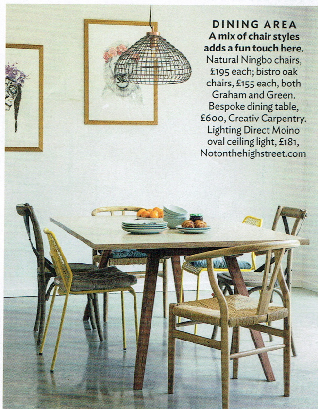
DINING AREA A mix of chair styles adds a fun touch here. Natural Ningbo chairs, £195 each; bistro oak chairs, £155 each, both Graham and Green. Bespoke dining table, £600, Creativ Carpentry. Lighting Direct Moino oval ceiling light, £181, Notonthehighstreet.com

The planners didn't refuse the Ralphs' design, but couldn't