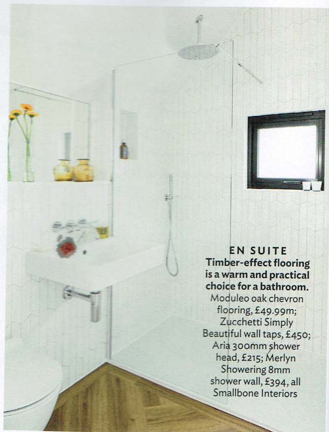
EN SUITE Timber-effect flooring is a warm and practical choice for a bathroom. Moduleo oak chevron flooring, £49.99m; Zucchetti Simply Beautiful wall taps, £450; Aria 300mm shower head, £215; Merlyn Showering 8mm shower wall, £394, all Smallbone Interiors

DECORATING TIP 'If you have white walls like we do, introducing colourful fabrics and geometric patterns will help to bring the interior alive and offer interest'