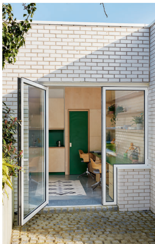
FEATURE CAROLINE FOSTER FLOOR PLAN RJH SURVEYING

“Lockdown restrictions made us seek out local craftsmen and suppliers, which turned out to be a bonus. It was easier and felt good to support local businesses”