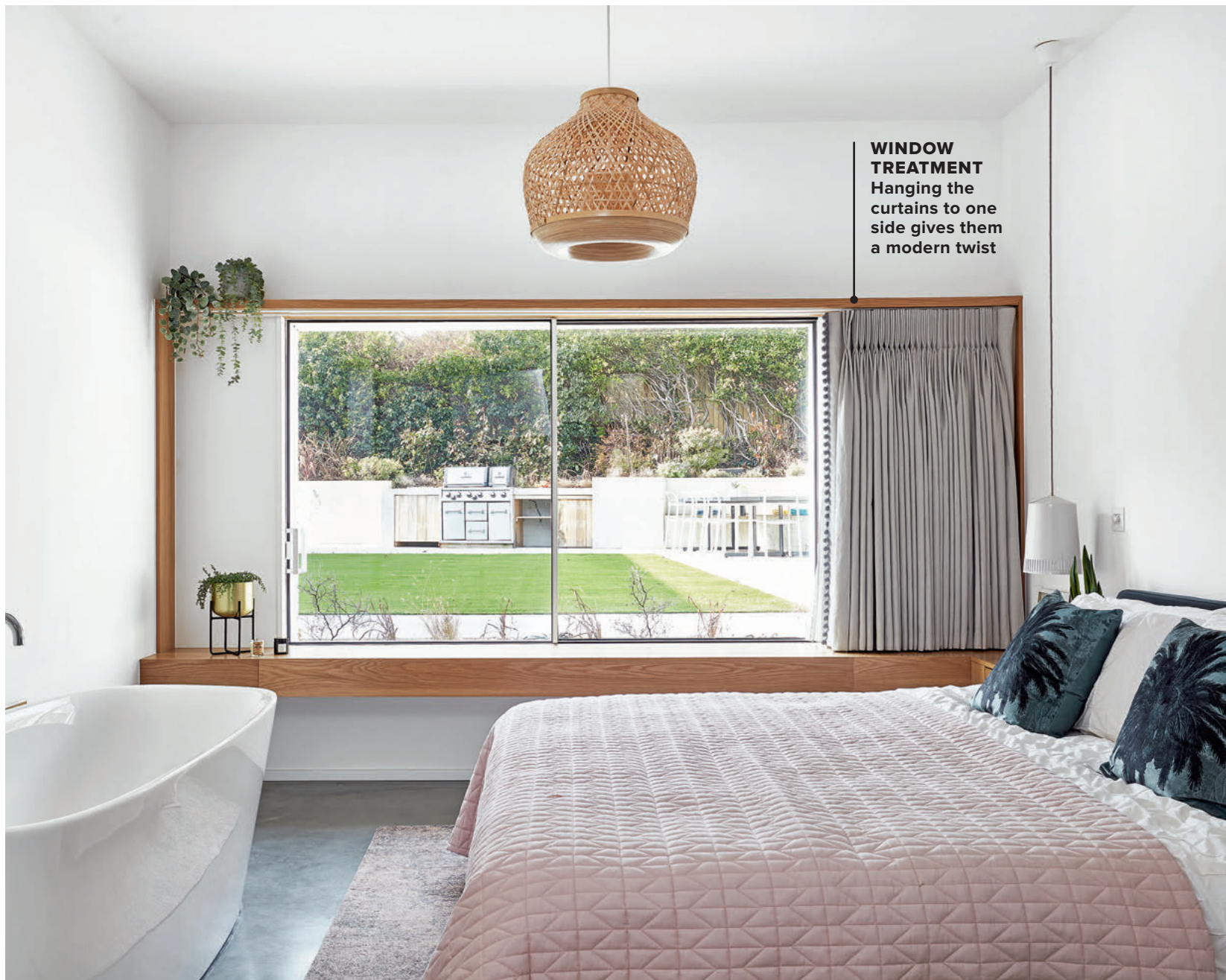
WINDOW TREATMENT Hanging the curtains to one side gives them a modern twist